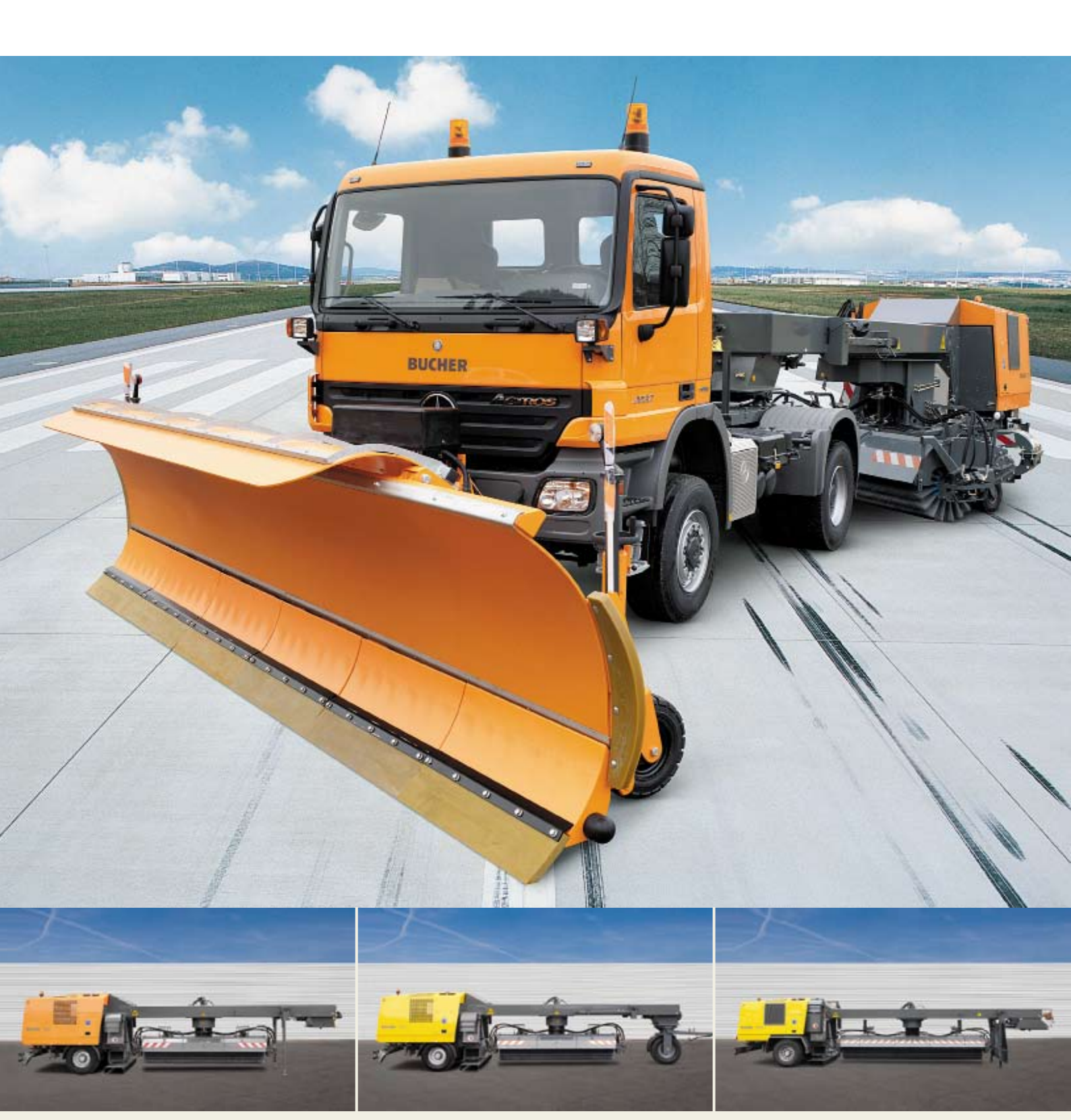
P 21 as a semi-trailer

Our standard snow sweeper is built to handle all winter conditions at airports.